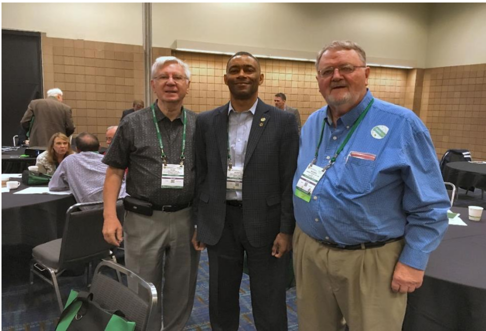
VOS Board members at ASSP PDC New Orleans June 2019