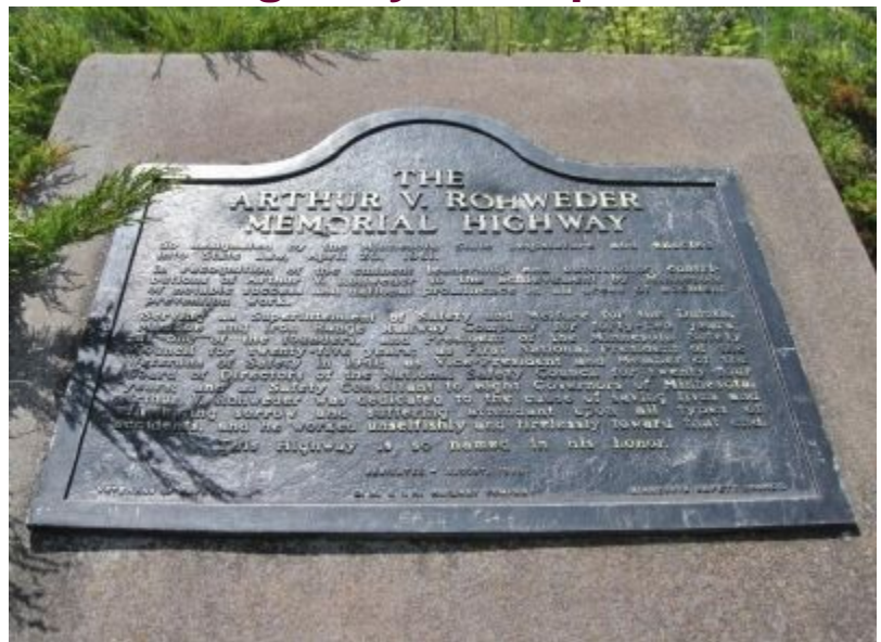
The Arthur V. Rohweder Memorial Highway Marker